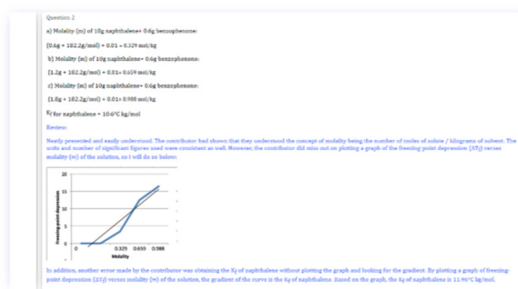
Figure 2. A screenshot of a contributor posting (in black) and a reviewer posting (in blue) for the “Results and Calculation” portion of a lab wiki.

Note: The number(s) in the boxes correspond to the lab experiments: i.e., 9 = Experiment 9.