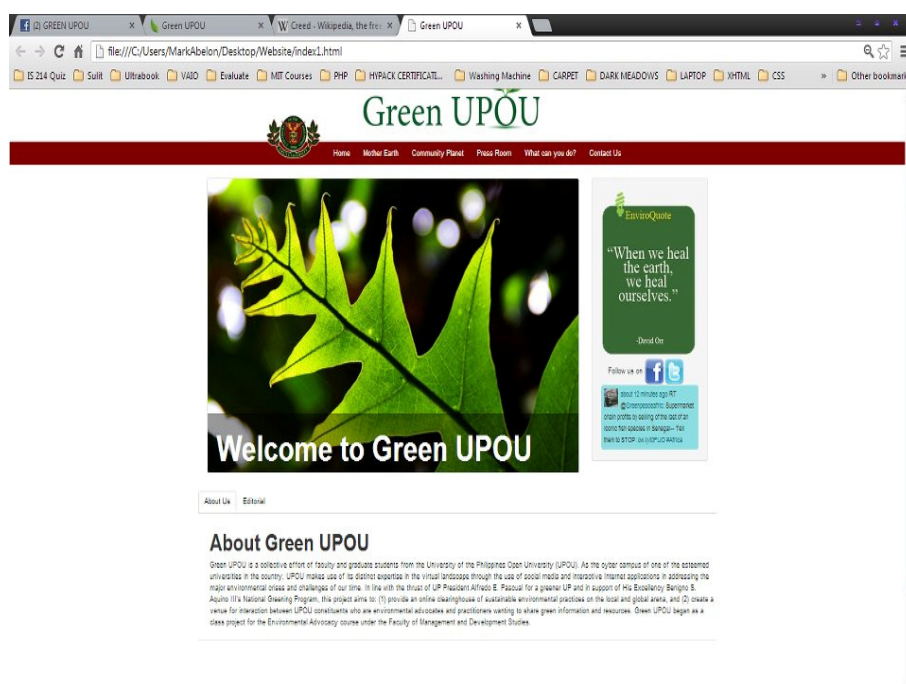
Figure 2: Screenshot of the home page of the Green UPOU

One of the requirements of the course was to develop the UPOU Green Website – an environmental advocacy using the Internet and online technology (Figure 2).